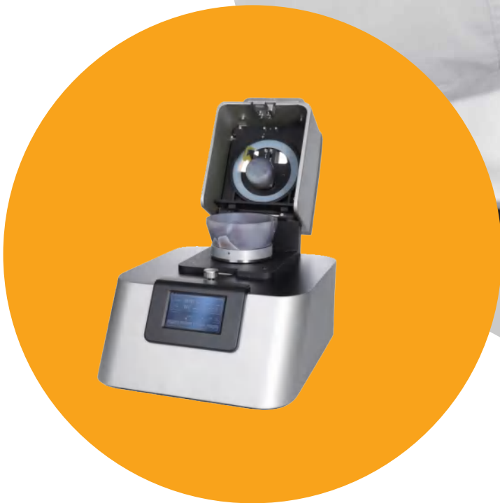
MG200 Mortar Grinder