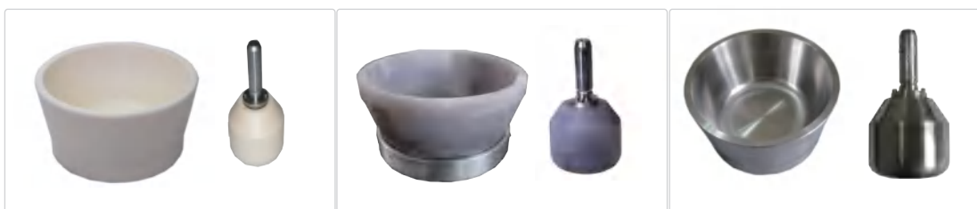
Sintered aluminium oxide