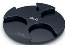
Heating Block Heating block for up to four disc reactors Ident. No. 0020103369