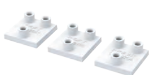
MX.PVDF Mixing chip set, polyvinylidene difluoride Ident. No. 0020103093