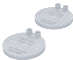
DR.PP narrow Disc reactor set, polypropylene, narrow, 2 pcs. Ident. No. 0020102705