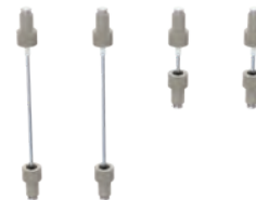
Capillary Set Ident. No. 0020103091