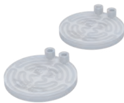
DR.PP standard Disc reactor set, polypropylene, standard, 2 pcs. Ident. No. 0020102637