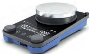
IKA Plate (RCT digital) Magnetic stirrer with heating Ident. No. 0025004601

If required, the following IKA devices are available for your lab to enhance flow chemistry with IKA FLOW System: