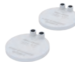
DR.PVDF standard Disc reactor set, polyvinylidene difluoride, standard, 2 pcs. Ident. No. 0020102638