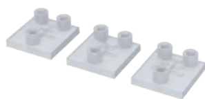
MX.PP Mixing chip set, polypropylene Ident. No. 0020103092