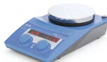
RCT basic Magnetic stirrer with heating Ident. No. 0003810000