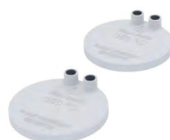
DR.PVDF narrow Disc reactor set, polyvinylidene difluoride, narrow, 2 pcs. Ident. No. 0020102706