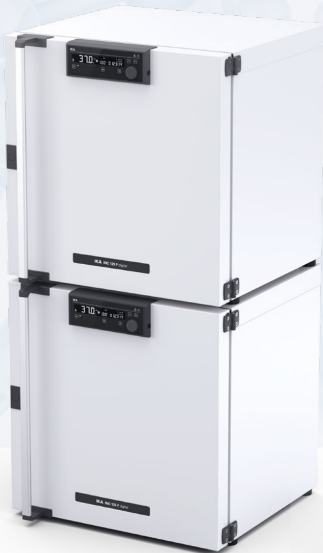
INC 125 F digital Ident-Nr.: 0020117172

With 125 liters, the interior of both devices is very large. The INC 125 F digital can accommodate up to six trays with samples. If the shaking platform of the incubator shaker is removed, this also applies to this unit. Nevertheless, both devices have a compact design. In addition, they can be stacked in a space-saving manner using appropriate accessories.