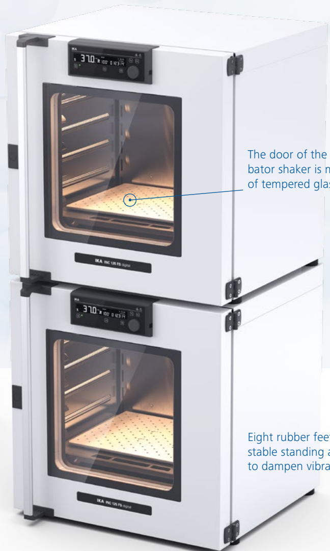
INC 125 FS digital SP20 Ident-Nr.: 0020117221